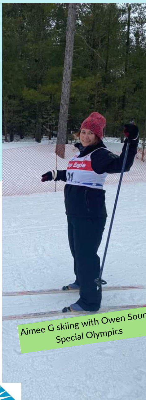
Aimee G skiing with Owen Sound Special Olympics