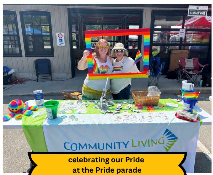
celebrating our Pride at the Pride parade