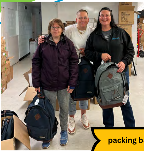
packing back packs for United Way