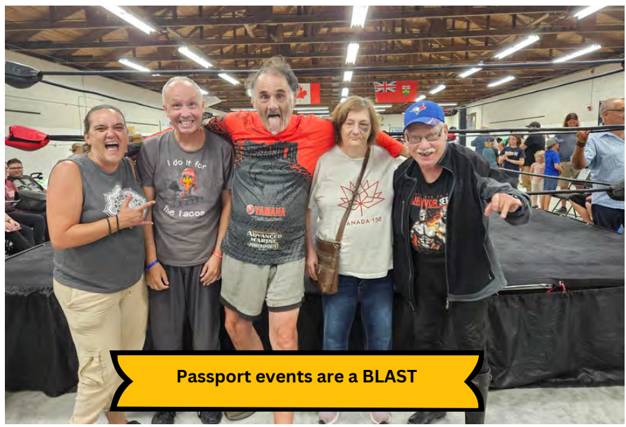
Passport events are a BLAST