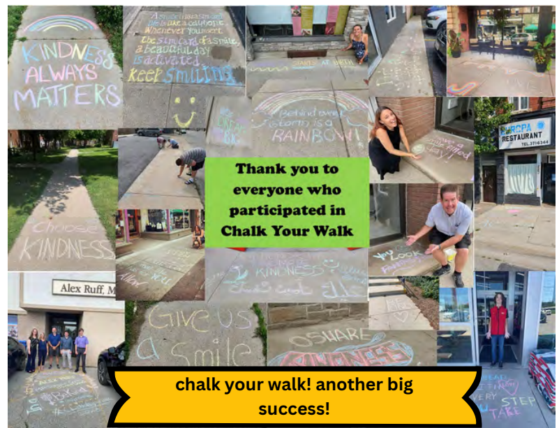
Thank you to everyone who participated in Chalk Your Walk chalk your walk! another big success!