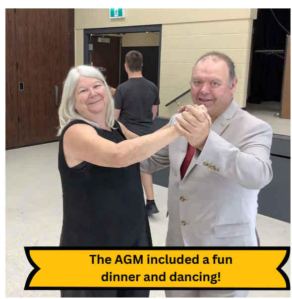
The AGM included a fun dinner and dancing!