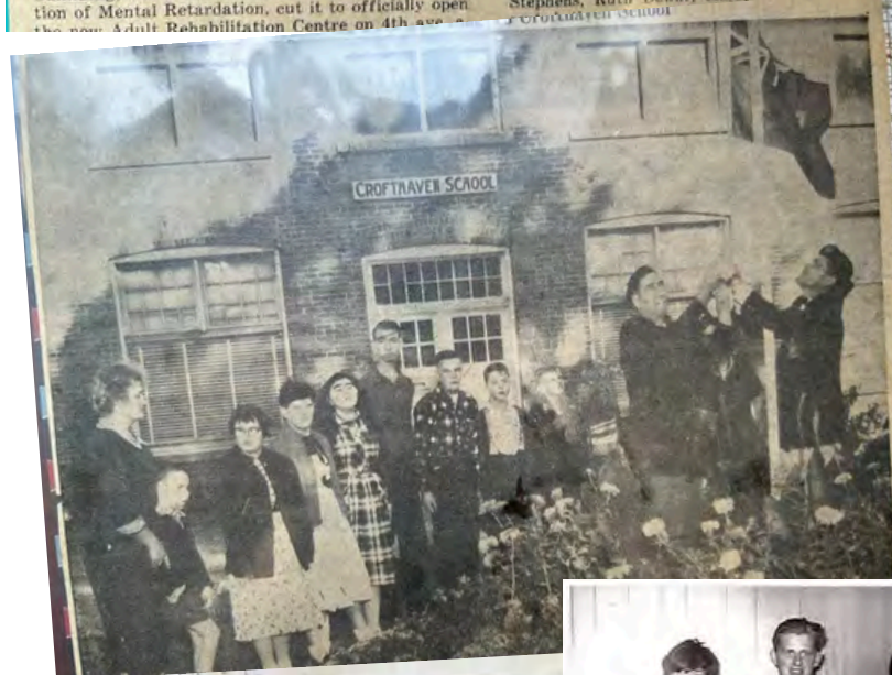
CROFT HAVEN SCHOOL