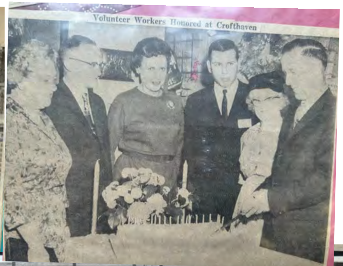
Volunteer Workers Honored at Croft Haven